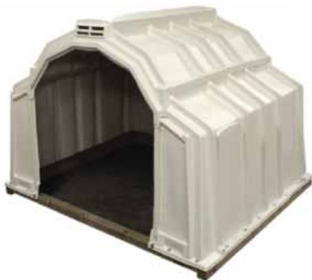
MULTIMAX UNIT/WOOD BASE/REAR VENT KIT - AH-105B-1