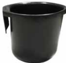
DIRECT ATTACH PAIL - CT-10023