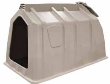
CALF HUTCH XXL PRO - CT-XO