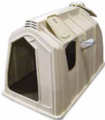
CALF HUTCH DELUXE II LEFT W/VENTS - CT-DLV