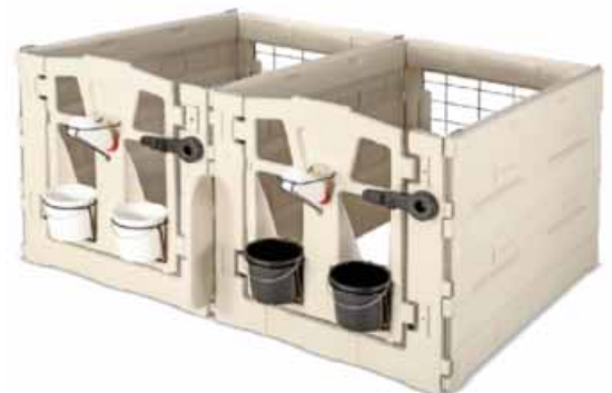
CALF PEN BACK AIRMAX - CT-6125

* Shown here are the most popular styles of hutches. For more options or for replacement parts contact us direct at 800.426.2697